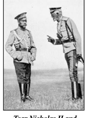
Tsar Nicholas II and Grand Duke Nikolai Nikolaevich

pedigree book. The best specimens of the sporting breeds were exhibited "in the special dog breeding pavilion of the All-Union Agricultural Exhibition." (Chadwick 27)