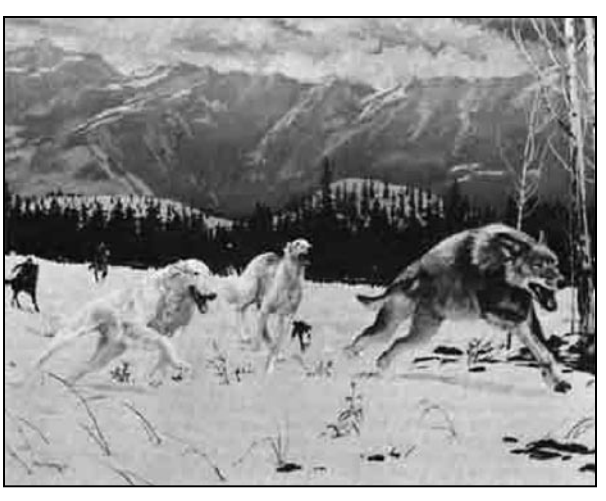
Wolf Hunt. Artist's interpretation.

To be successful at catching and holding wolves, the Borzoi had to use the proper techniques which were learned through encouragement and practice hunting young wolves. It was felt that hunting young but free wolves was better training than their chasing captive-raised wolves. The captive wolves did not have the smell of wolves of the wild, did not run as well and stopped and snapped at the hound chasing it. (Sabeneev) Training usually began between the ages of 10 and 12 months. A wolf would be released into an enclosed area and two young hounds were then slipped or released. A huntsman supervised to ensure that it was a positive training experience for the hounds. (Craven 13) Russians considered the fox hunting practiced in Great Britain as much too formal and pre-