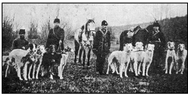
Russian hunt. Circa 1910

The origin of the Borzoi continues to be a topic of conjecture and debate among fanciers of the breed. Several Borzoi authorities believed the Borzoi to be a cross between the Northern Lapphund and the Tatar coursing hound. There are several examples in Russian literature that