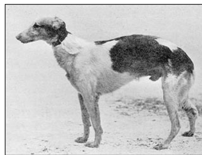
Borzoi owned by Tsar Nicholas II, 1897. Note the short coat.