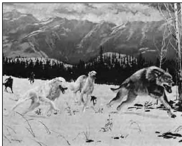
Wolf Hunt. Artist's interpretation.

To be successful at catching and holding wolves, the Borzoi had to use the proper techniques which were learned through encouragement and practice hunting young wolves. It was felt that hunting young but free wolves was better training than their chasing captive-raised wolves. The captive wolves did not have the smell of wolves of the wild, did not run as well and stopped and snapped at the hound chasing it. (SABANEV) Training usually began between the ages of 10 and 12 months. A wolf would be released into an enclosed area and two young hounds were then slipped or released. A huntsman supervised to ensure that it was a positive training experience for the hounds. (CRAVEN 13) Russians considered the fox hunting practiced in Great Britain as much too formal and pre-