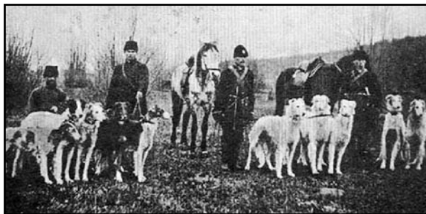
Russian hunt. Circa 1910

The origin of the Borzoi continues to be a topic of conjecture and debate among fanciers of the breed. Several Borzoi authorities believed the Borzoi to be a cross between the Northern Lapphund and the Tatar coursing hound. There are several examples in Russian literature that